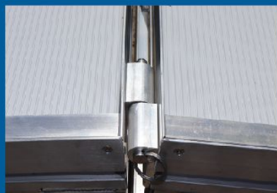
Quick Release Hinge