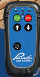
BOAT LIFT REMOTE